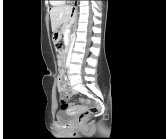
Figure 2: Sagittal CT image demonstrating free air (arrows) free fluid (asterisk) in abdomen.

Gastric and duodenal ulcers are often collectively referred to as PUD because of the similarity in their pathogenesis and treatment. Helicobacter pylori and NSAIDs contribute the most to PUD. Complications from PUD include hemorrhage, obstruction, cancer, and perforation. A better understanding of the risk factors for PUD has led to a significant decrease in complications of the disease. Total admissions for PUD have decreased by almost 30% since the 1990's [2]. The percentage of patients who require emergent surgery for complicated disease has decreased, to approximately 11% [2]. Perforation has the highest mortality rate of any complication of ulcer disease, approaching 15% [2]. Despite a decrease in reported ulcer-related mortality, from 3.9% in 1993 to 2.7% in 2006, over 4,000 estimated deaths are caused by PUD each year.