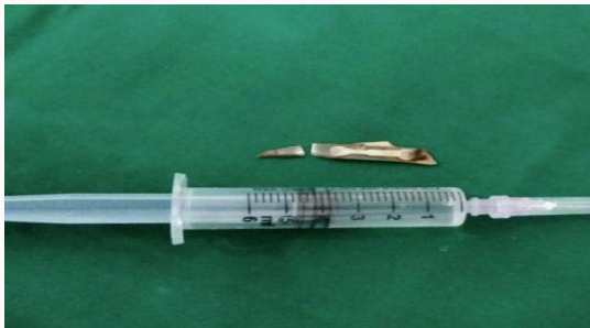
Figure 3: Two pieces of the surgical blade recovered after surgery.

are usually secondary to a gunshot or stab wound [6,7]. There have been reports of impacted chopsticks [8], pen [6] and wooden piece [2]. However, retention of a surgical blade (No.11) is less reported. The diagnosis of penetrating neck trauma with an associated foreign body in situ is generally quite obvious from history or clinical examination. However identifying a foreign body can be very challenging at times, especially in cases where the impacted body is very thin or radiologically not very clear [6,9]. Precise localization of the foreign object is essential for complication free removal [6]. The current mortality rate for penetrating neck injury is 3-6%. The usual complications of penetrating neck injuries is less than 10% to as high as 20% and a mortality rate of as high as 20% is also reported [2,5,10].