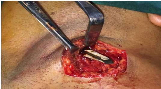
Figure 2: Intra-operative picture showing surgical blade in the left side of the neck.