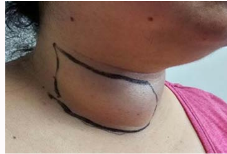
Figure 2A: Day 3, of presentation.