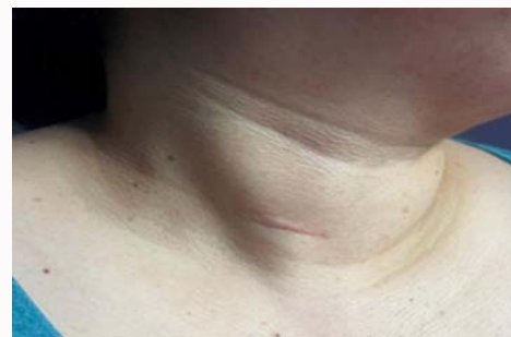
Figure 2B: Week 8, post incision and drainage.