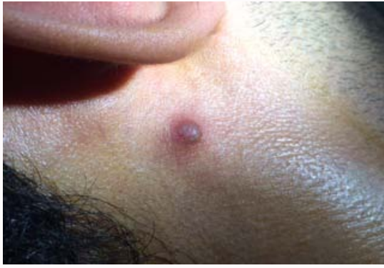
Figure 1: Dusky red, round, raised papule with an erythematous and inflamed base.