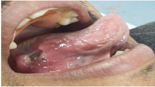
Figure 1: Recurrence of eosinophilic ulcer on right lateral margin of tongue after surgical excision showing yellow base with raised margins and remnant of vicryl suture in situ .