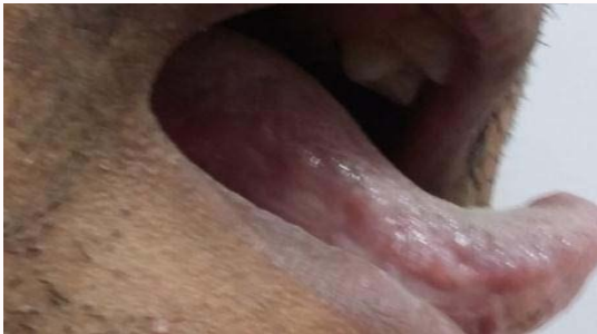
Figure 2: Completely healed ulcer after conservative management.