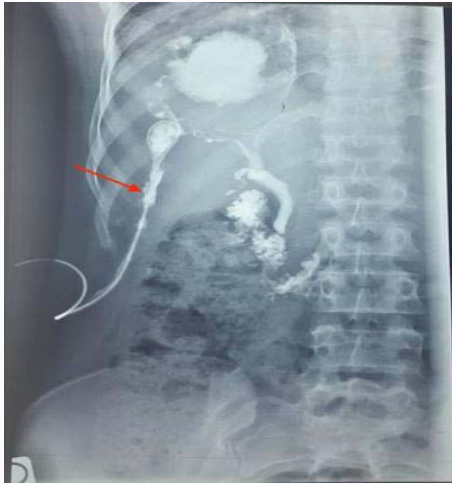
Figure 1: Percutaneous fistulography showing liver hydatid cyst fistulized to the skin (Red arrow).