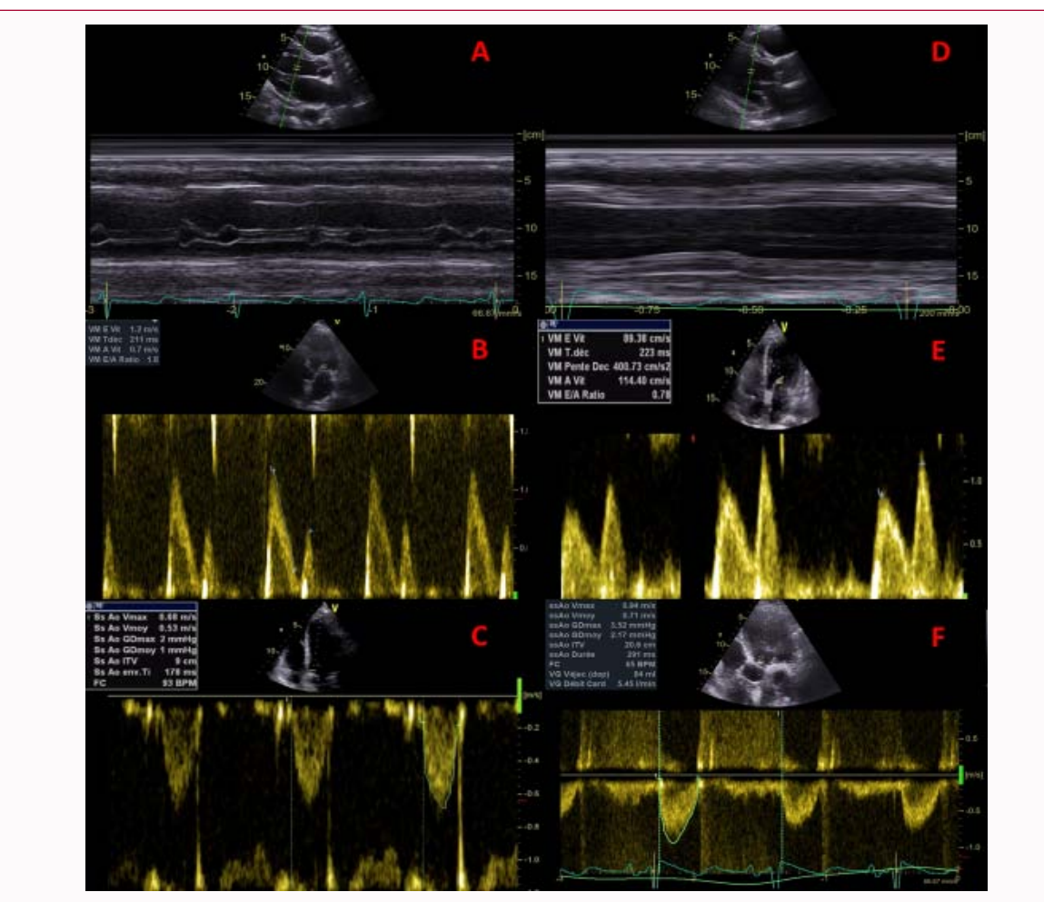
Figure 2: Echocardiographic assessments during cardiogenic shock and recovery.

A, D: Left ventricle profile in M-mode, performed in the parasternal long-axis view, during cardiogenic shock (D1) and recovery (D5).