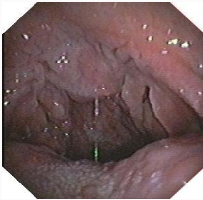
Figure 1: Fiber optic laryngoscopy view before pharynx syphilis treatment: tonsil, palatoglossus arch, palatopharyngeus arch, palatine uvula was covered by white pseudomembrane.