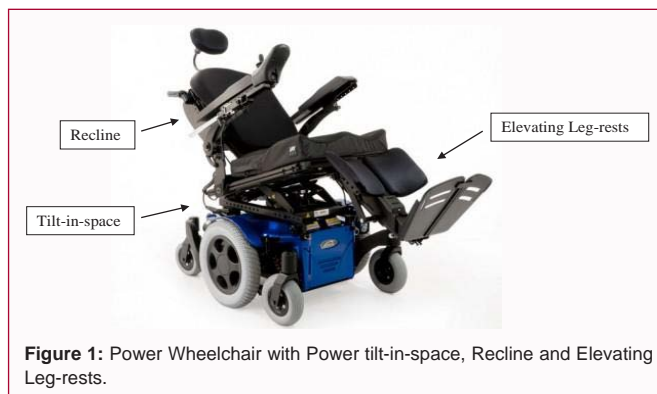
Figure 1: Power Wheelchair with Power tilt-in-space, Recline and Elevating Leg-rests.

• Self-Feeding: Dependent from wheelchair. • Instrumental ADL Status: XXX reports she is able to go out in the community as well as direct her attendant care independently from her power wheelchair.