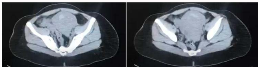
Figure 2: Uterus in Anteroverso bending 121 mm × 74 mm × 86 mm, myometrium anterior wall is observed thinned 13 mm concerning the rear, to background level is observed irregular loss of the interface with the endometrial cavity which presents strengthening the administration of contrast medium dependent of arcuate arteries towards the uterine fundus with two images of irregular morphology that together measure 16 mm 17 mm × 21 mm. Diagnostic impression: findings suggestive of retention of products of conception associated with uterine arteriovenous fistula.

Paraclinical studies were carried out which reported Hemoglobin 6, hematocrit 18%, platelets 259 thousand, Usg pelvic or that reported uterus of 116 mm × 83 mm, the endometrium of 60 mm about ovular remains, with heterogeneous myometrial color Doppler vascularity. The patient was stabilized with fluid volume replacement and blood transfusions and diagnosed as probable abnormal uterine bleeding secondary to the retention of ovular remains, so instrumented uterine curettage was performed and a sample was sent to pathology which reported these ovule-placental degenerative changes associated with retention, it is decided high of service, without however the patient again presents bleeding transvaginal abundant that warrants hospitalization, is performed ultrasound reporting endometrium 27 mm with area anechoic inside located in fundal that after application of Doppler color, vascularity is identified at the level of the endometrial