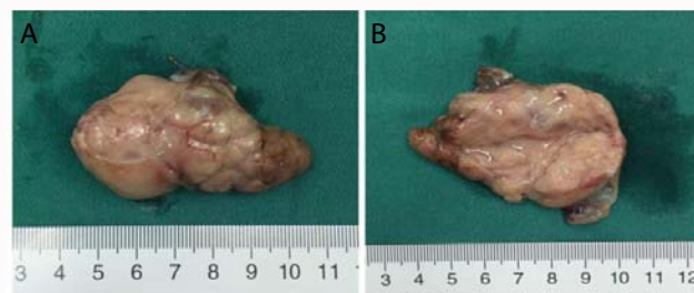
Figure 4: Gross examination of the resected specimen revealed a large duodenal lesion measuring 6 cm × 5 cm, with a smooth surface without erosions or ulcers.

Based on the macroscopic and ultrasonography characteristics, Brunner's gland Hamartoma was suspected. Furthermore, in consideration of that this patient had no serious complications; we intended to resect it endoscopically. The patient agreed to undergo endoscopic resection. Anatomic characteristics of the duodenum make endoscopic resection of duodenal lesions challenging. However, advanced endoscopic techniques enable the endoscopic resection of large duodenal lesions. This lesion was successfully resected without any complications, and the specimen was obtained for pathological analysis. Gross examination of the resected specimen revealed a large sessile duodenal lesion measuring 6 cm × 5 cm, with intact mucosa without erosions or ulcers (Figure 4). Figure 5 shows a histologic section of the mass stained with Hematoxylin and eosin. Microscopic examination showed that the mass was composed of lobules of relatively bland-appearing Brunner's glands, which were surrounded by bundles of fibro muscular and connective tissue without atypical glands, confirming the diagnosis of Brunner's gland Hamartoma. The