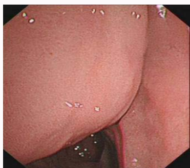
Figure 1: Upper endoscopy presented a subepithelial sessile duodenal lesion.