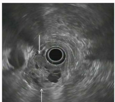
Figure 2: Endoscopic ultrasonography showed a cyst-solid lesion (arrow).