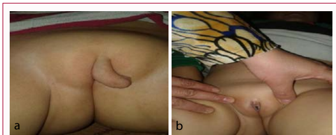
Figure 1: a) Clitoromegaly before surgery b) after clitoroplasty.