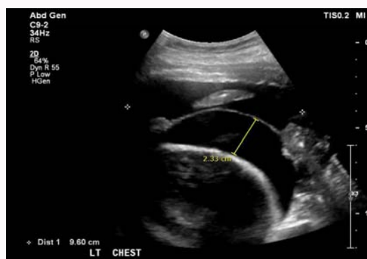
Figure 2: Ultrasound of Chest (USS) showing a left sided pleural effusion.

Neuropsychiatric manifestations can not only be frequent in up to 90% patients with SLE but can be on a wide spectrum from peripheral neuropathies, psychosis, seizures to cognitive dysfunction [15]. The relationship between pregnancy and SLE is interesting and has been thoroughly reviewed in literature. The effect of SLE on fertility is debatable. Although some studies have suggested a reduction in fertility amongst SLE patients due to age, less ovarian reserve with cyclophosphamide, disease activity and concurrent antiphospholipid syndrome [16-18], others have not observed differences in fertility due to good disease control prior to conception and less use of cyclophosphamide [16-19].